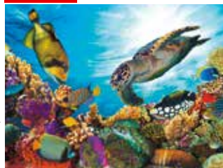
Correct drop landing position and paper feeding ensures the highest print quality