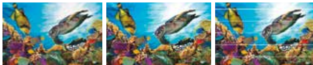
Incorrect bi-directional drop landing position Overlap / black streaks (Insufficient paper feeding) Gap / white streaks (Excessive paper feeding)

* DAS may not be compatible with some media such as coloured, transparent, and embossed substrates.